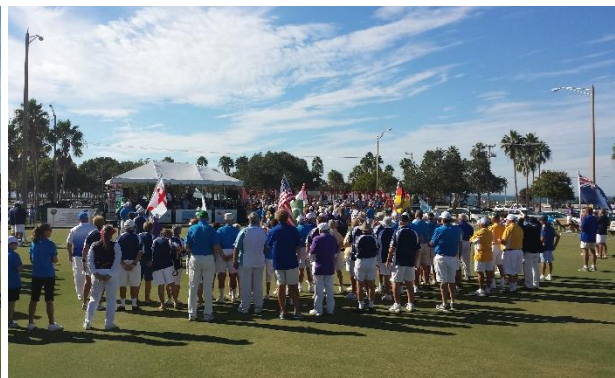
Lawn Bowling the Opening Ceremonies